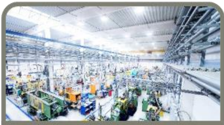
Organic Industrial Base