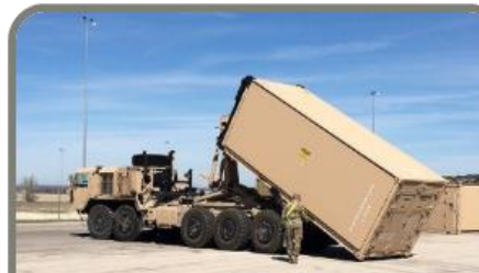
Logistics Readiness Centers