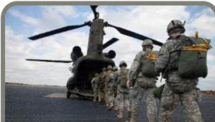
Global Distribution & Deployment