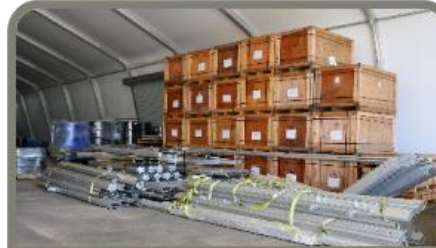
Army Prepositioned Stocks