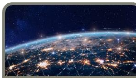
Global Materiel Management